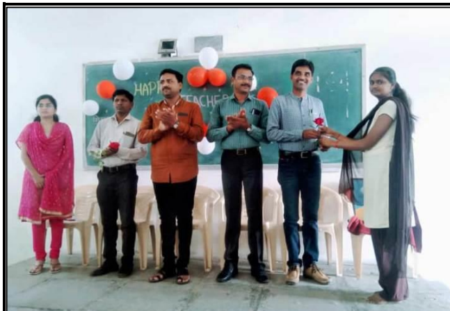
Student welcoming the department staff