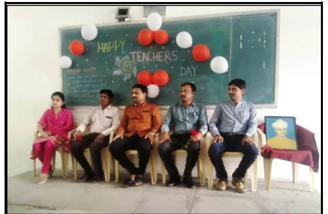
Departmental staff on the stage on the occasion of Teachers Day Celebration